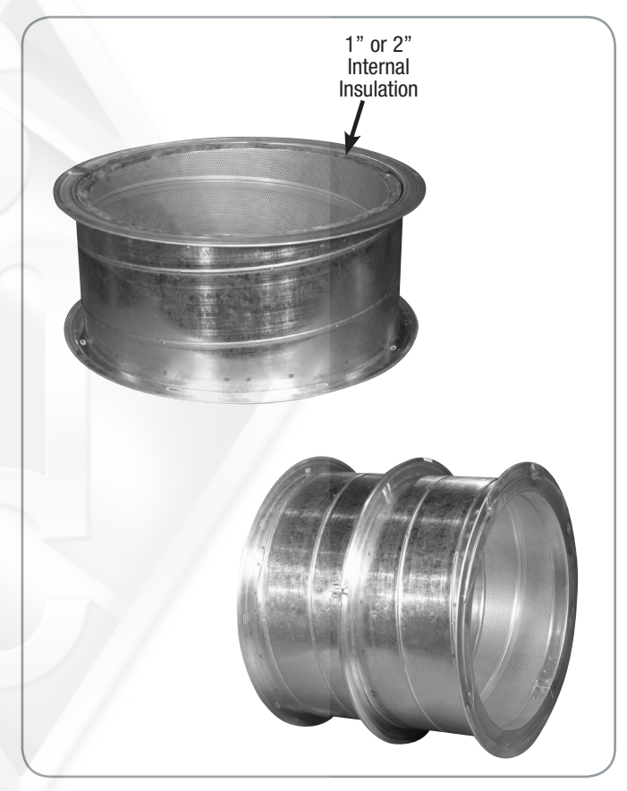
Inside dimensions to be listed