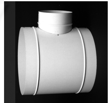
Dimensions to be listed as follows: A, B, C L = "C" + 2"