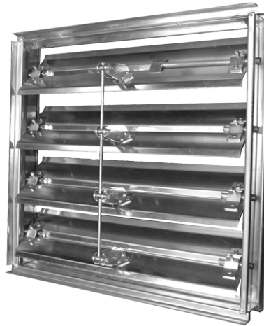
Model: PBN Parallel Blade Non-Sealed Balancing Damper