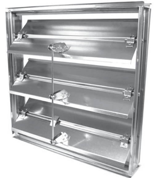
Model: PBS Parallel Blade Sealed Damper