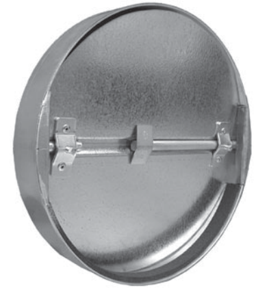
Model: RSBS Round Single Blade Sealed Damper