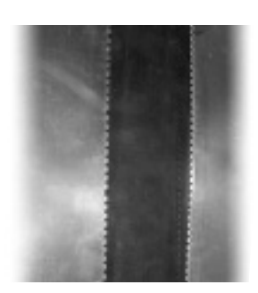
Construction: A double folded Fabric/Metal Connector, notched for easy fabrication.